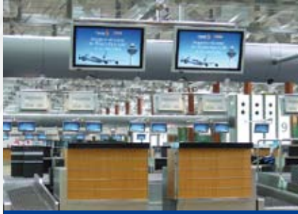
Changi Airport Singapore / SN