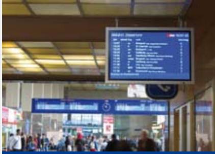
Vienna Train Station / A