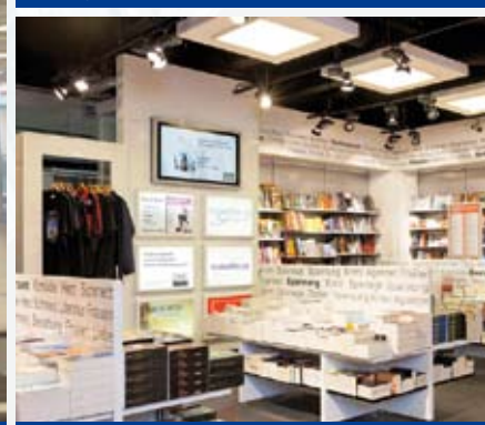
Book shop Hollmann, Duesseldorf / D