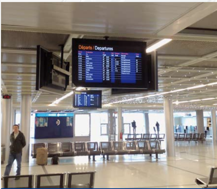
Nantes Airport / F